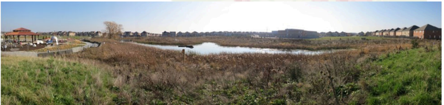
Restored & enhanced wetland

Left: Planting Plan; Top: Plantings and play area; Middle: plantings and wetland; Bottom: Bioretention cell